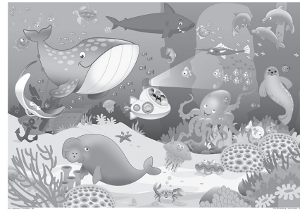
See page iv for how to download this image.